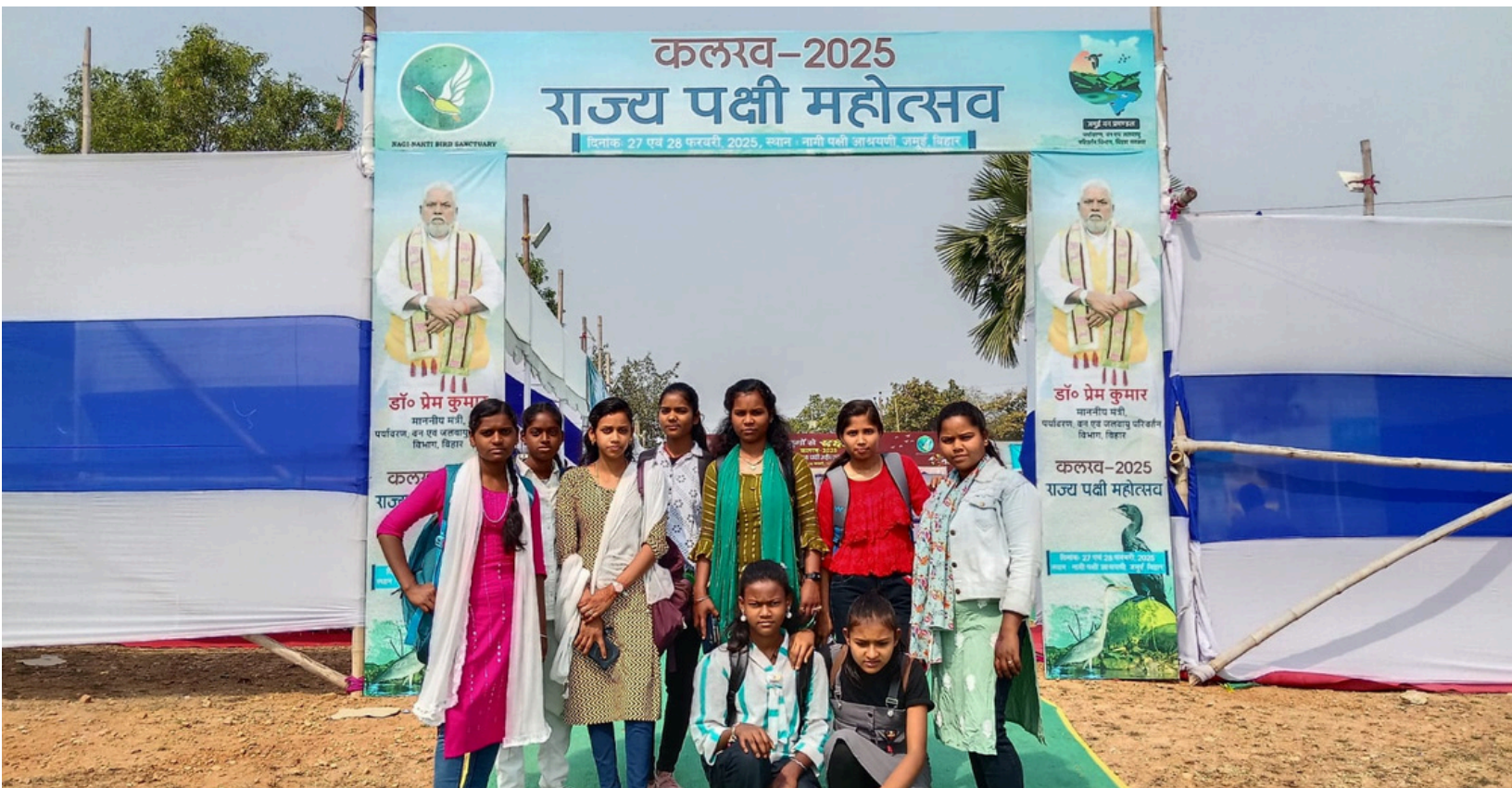
At kalrav, bird festival in Nagi Nakti Dam

"The Earth is what we all have in common." — Wendell Berry